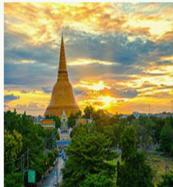
Nakhon Pathom, Thailand : Asian ESL Kindergarten Teacher