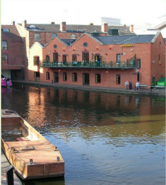
Birmingham, England : Paki Pre-K and Kindergarten Teacher