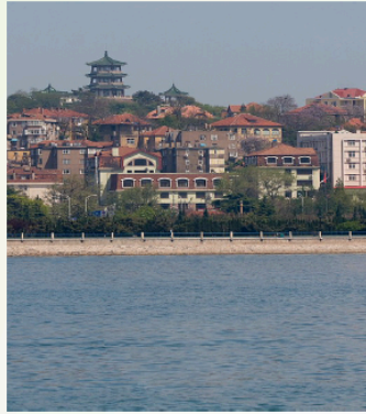
Qingdao, China : Black ESL Kindergarten Teacher